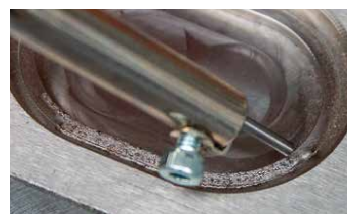
Coating of a machine part